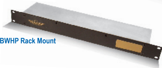
• EBWHP Rack Mount

Custom Brick Wall Highpass Available Per Request.