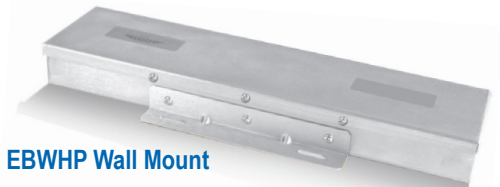
• EBWHP Wall Mount

Specifications subject to change without notice.