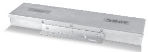
• EBWD Wall Mount