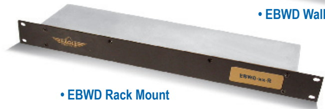
• EBWD Rack Mount

Eagle Comtronics Inc. is a leading manufacturer of RF products. We offer many products as well as quick response on custom request. For more information email our sales staff : sales@eaglecomtronics.com or visit our web site: eaglecomtronics.com.